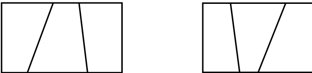
Diagram #4 - blocks organization and borders

Diagram #3 Two piles, one you call UP, the other is DOWN